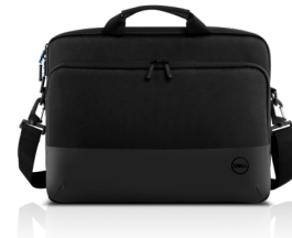
DELL PRO SLIM BRIEFCASE 15 | PO1520CS

With fast, high-power delivery of up to 65W/hr, this power bank can charge the widest range of USB-C® laptops and mobile devices.