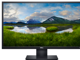
DELL 24 MONITOR | E2420HS

Work at full speed with Dell's powerful USB-C dock. Charge your system faster, support up to three displays and connect to your peripherals via a single cable.