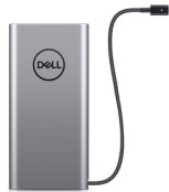
DELL USB-C NOTEBOOK POWER BANK 65W/65WHR | PW7018LC

Work seamlessly with dual-mode connectivity (2.4GHz wireless or Bluetooth) and 36 months of