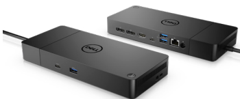
DELL DOCK | WD19S

Work at full speed with Dell's powerful USB-C dock. Charge your system faster, support up to three displays and connect to your peripherals via a single cable.