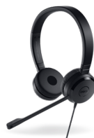
DELL PRO STEREO HEADSET | UC150

Enhance your all-day productivity with this wireless keyboard and mouse combo. Keeps your desk clutter-free and lets you stay productive with up to 36 months battery life and programmable shortcut buttons.