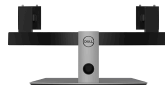
DELL DUAL MONITOR STAND | MDS19

Hear every word clearly on your next call with the Dell Pro Stereo Headset, optimized to provide in-person call quality.