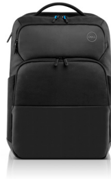
DELL PRO SLIM BACKPACK 15 | PO1520PS

Featuring the widest variety of ports available, the compact 7-in-1 Dell USB-C Mobile Adapter offers seamless connectivity to various devices like monitors, projectors, headsets, keyboard, mouse, flash drives and other accessories.