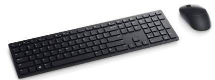
DELL PRO WIRELESS KEYBOARD AND MOUSE | KM5221W

A 23.8" monitor enhances your daily workflow. Featuring a height adjustable stand, Full HD resolution and integrated speakers in a space-saving design.