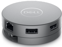
DELL USB-C MOBILE ADAPTER | DA310

Featuring the widest variety of ports available, the compact 7-in-1 Dell USB-C Mobile Adapter offers seamless connectivity to various devices like monitors, projectors, headsets, keyboard, mouse, flash drives and other accessories.