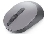
DELL MOBILE WIRELESS MOUSE | MS3320W

A dependable everyday companion providing eco-friendly quality protection and water-resistant protective coating for your device and other essentials.