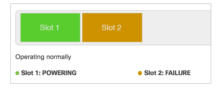
Redundant power supply monitoring & alerts